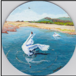
“Look at me” Acrylic on recycled plywood cheese box lid Diameter 10.2cms, circumference 38cms