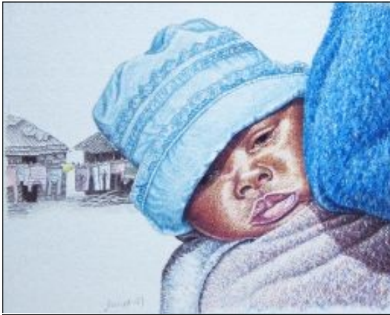
African Princess 2

Throughout history, portraits have been a significant portion of the art created. Even today, whether full-sized paintings or miniatures, portraits continue to be an important genre that many artists produce to a very high standard. Portraiture is one of the more exacting artistic disciplines, but it is also incredibly rewarding. Attention to detail is very important, as capturing the exact shape of an eye, for instance, will accurately depict the person, or, failing that, maybe only achieve a faint resemblance.