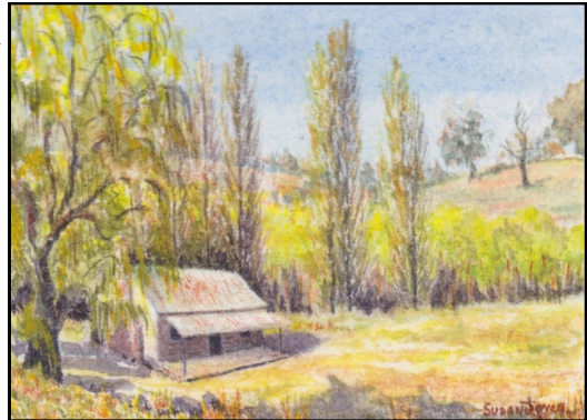
“The Miner's Shack” - Watercolour on paper, 5 x 7cms (Actual size)