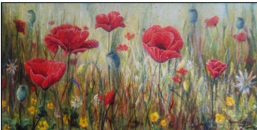
“Memory” - Acrylic on board, 10 x 20 inches (obviously NOT a miniature!)

ASMA Tasmania Inc. is a member Society of the World Federation of Miniaturists which includes Societies in the USA, UK, South Africa and